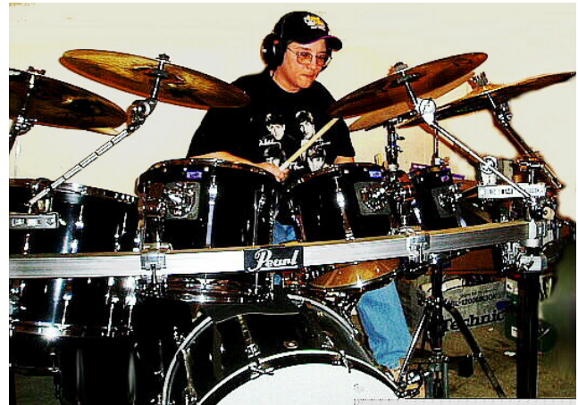
Deejay Playing With Splashes removed for photo